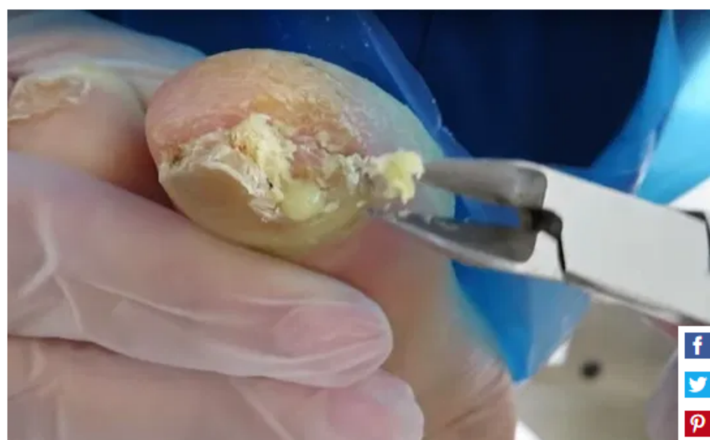
It might look uncomfortable, but Miss Yau said the patient won't have felt much pain

Paronychia is fungal nail disease that can form at the cuticle where the nail and skin meet.