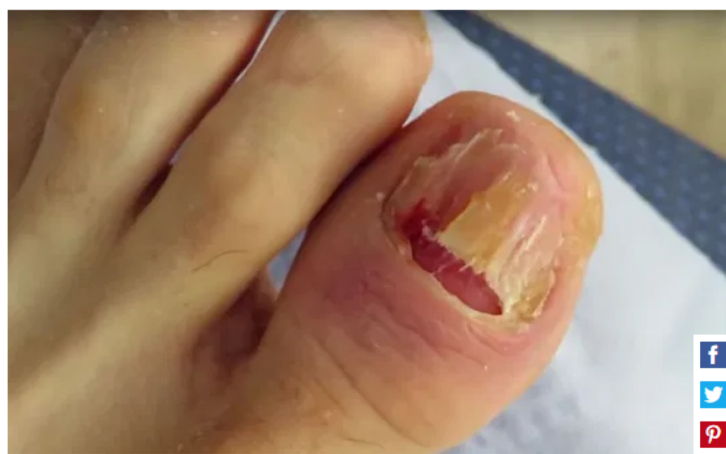
Good news, the patient healed well after the procedure

'This was the first case that I have seen this large amount of pus.'