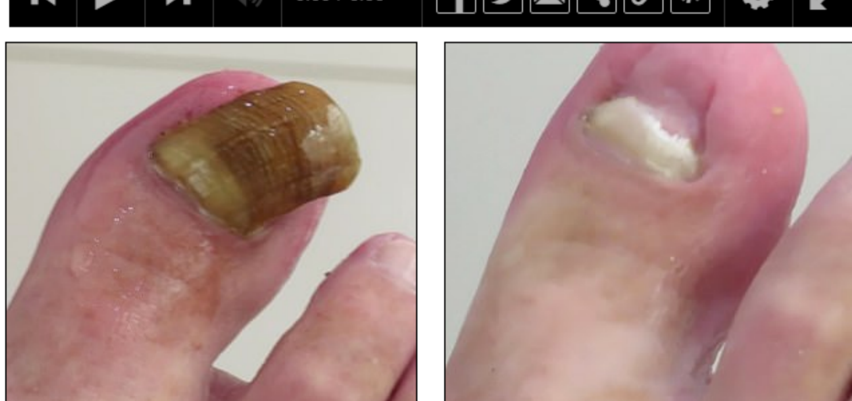
Gruesome video footage has captured the moment a man had an overgrown toenail chopped off and filed down by a podiatrist who calls herself 'Miss Foot Fixer'