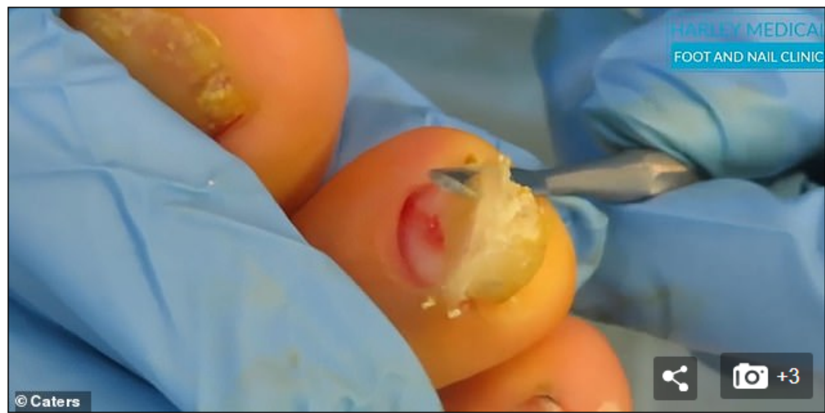
In the four-and-a-half-minute video, she described the 'total nail removal' she was getting ready to perform as being 'fantastic'