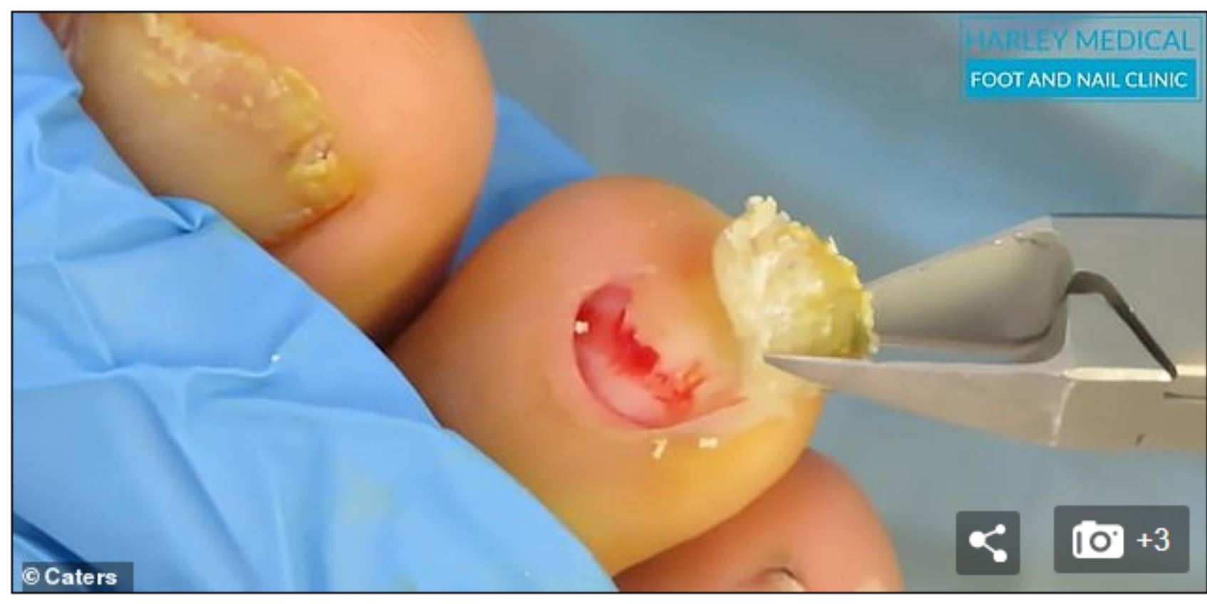
The grim video took another turn when Miss Foot Fixer picked up forceps to then pull the loose nail completely off

Underneath the former nail was a bed of red, sore skin. The podiatrist then began cleaning away the bed of skin.