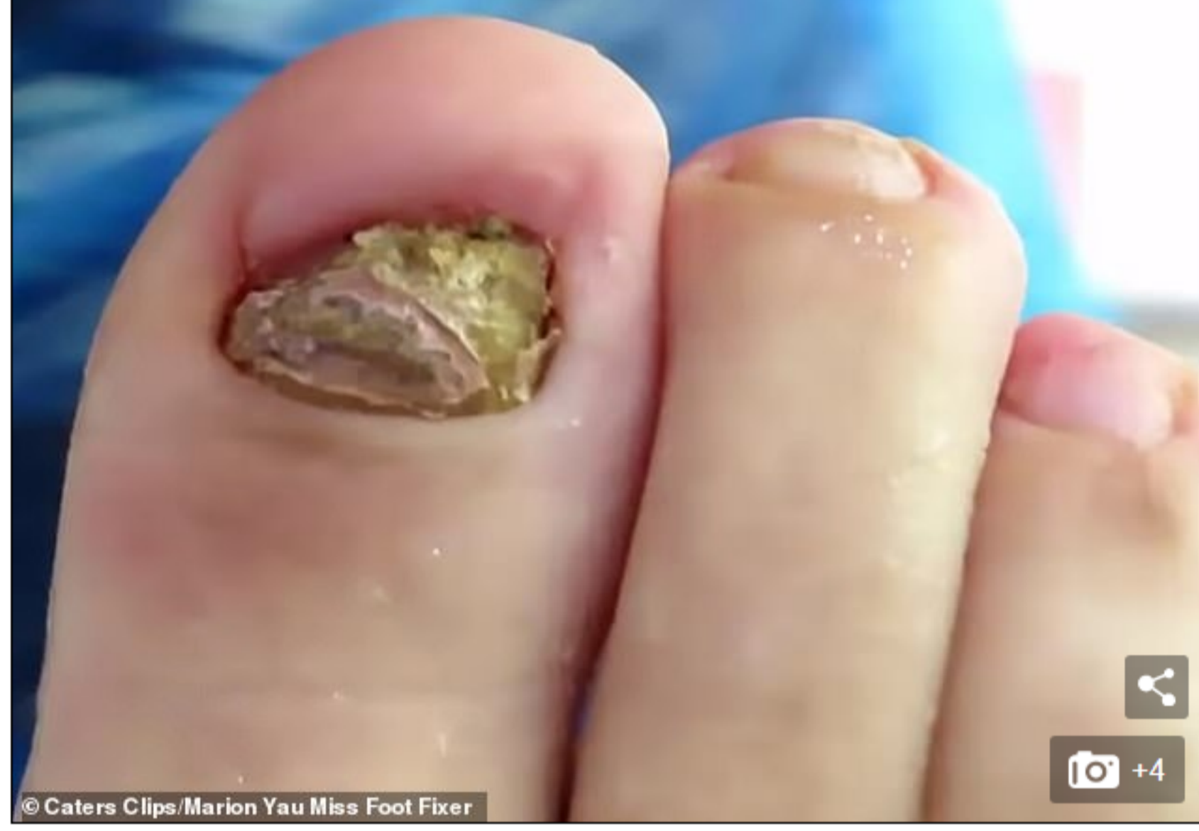
The unnamed woman's toenails were almost unrecognisable after it appears she let the infection get out of control. Pictured, the big toenail before treatment

Next, thick junk is released from the sides of the toenail, in what viewers described as 'fascinating'.