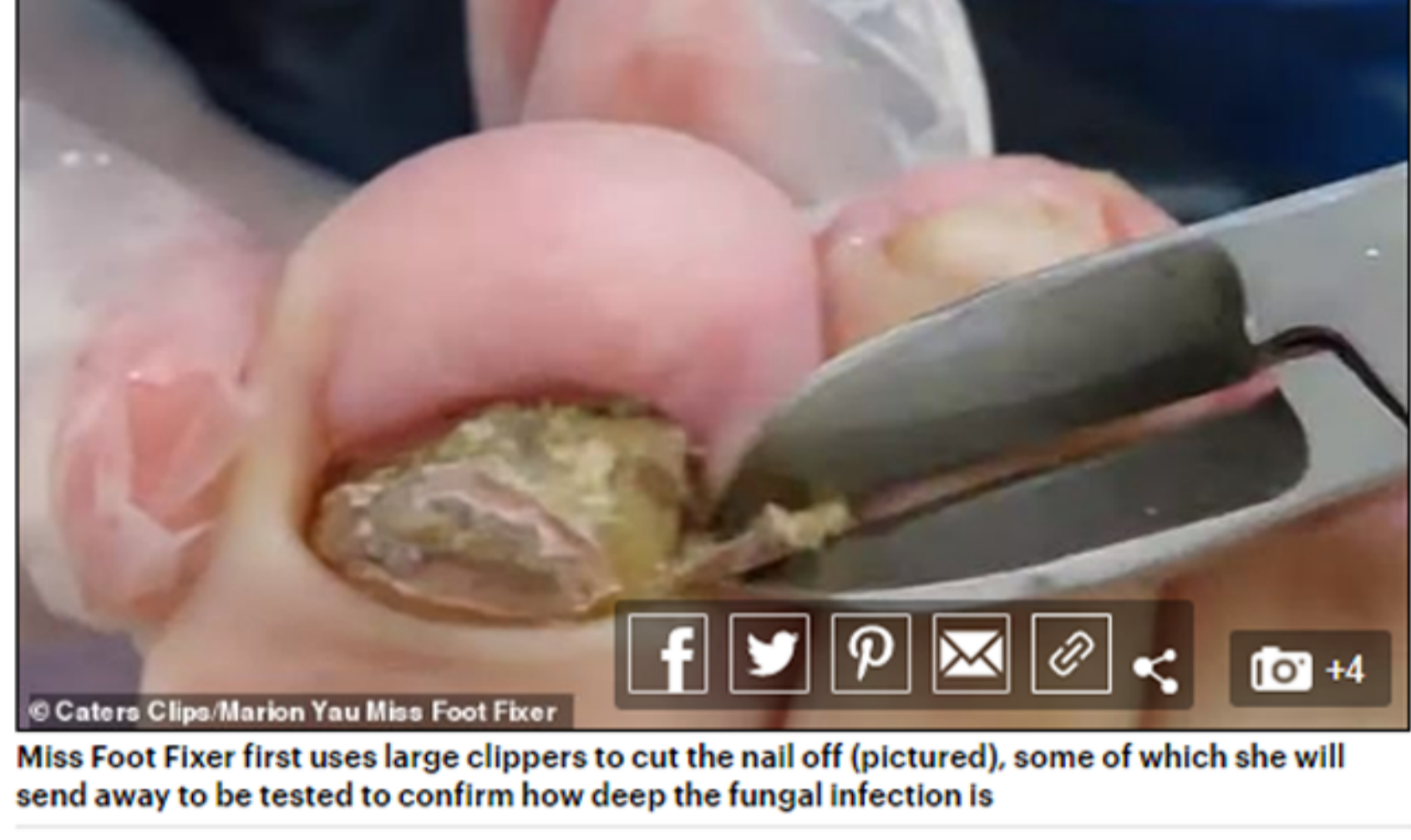
Miss Foot Fixer first uses large clippers to cut the nail off (pictured), some of which she will send away to be tested to confirm how deep the fungal infection is