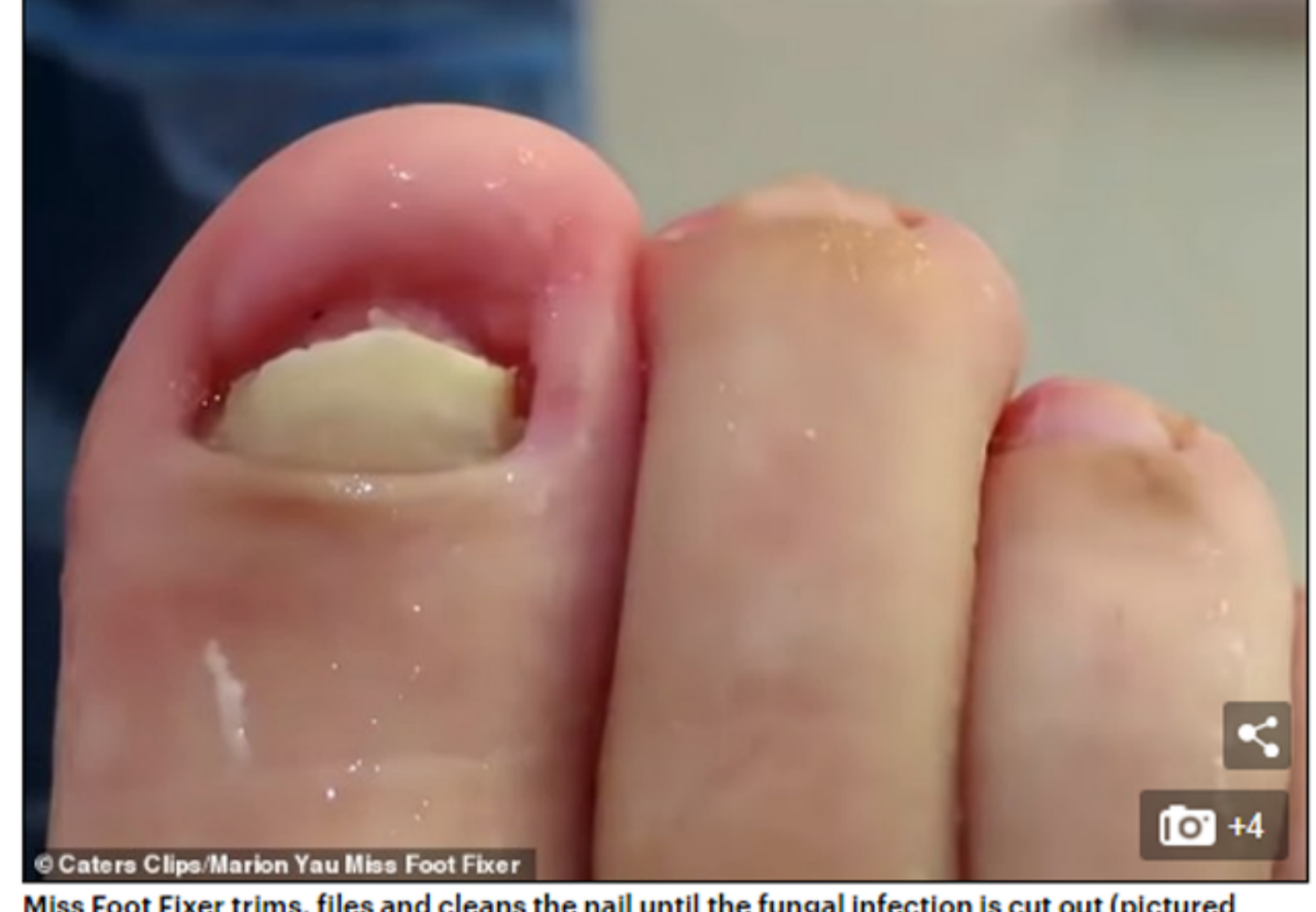
Miss Foot Fixer trims, files and cleans the nail until the fungal infection is cut out (pictured after)

Miss Foot Fixer reassured her patient that they are doing really well in what looks like a painful procedure - although anaesthetic will have been applied before.